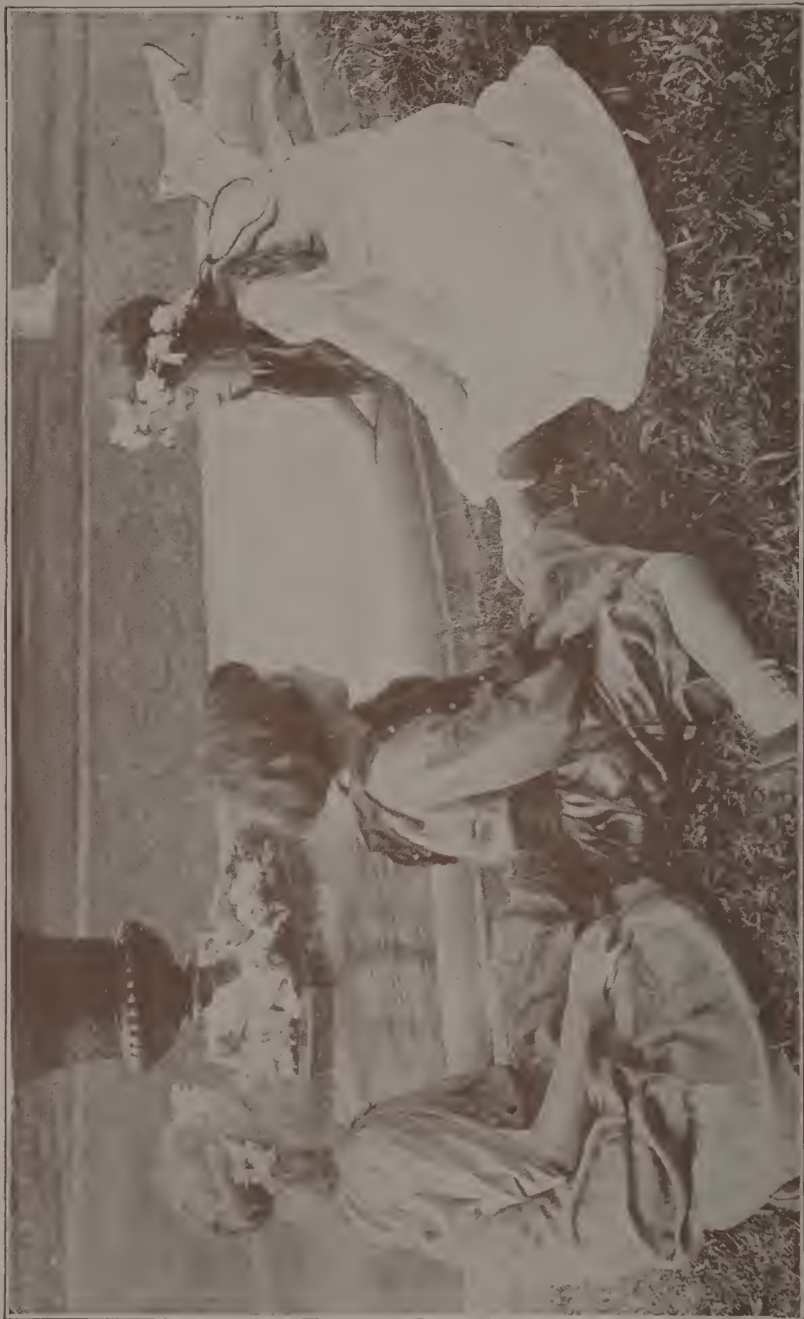
DO YOU BELIEVE IN FAIRIES?